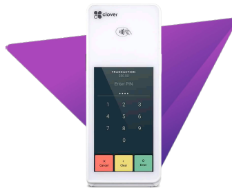
CLOVER FLEX POS All-in-one wireless smart POS