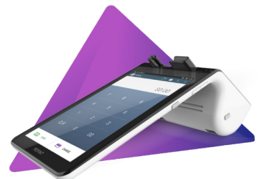
POYNT TERMINAL World's first smart terminal