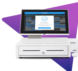
SIRIS POS Scheduling + product solution