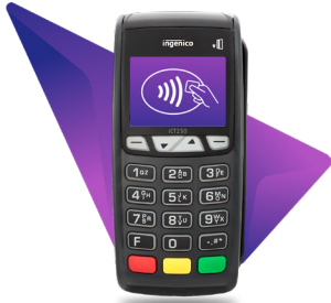
INGENICO ICT250 Colour desktop

Ask for advice and complete a cost analysis to get informed.